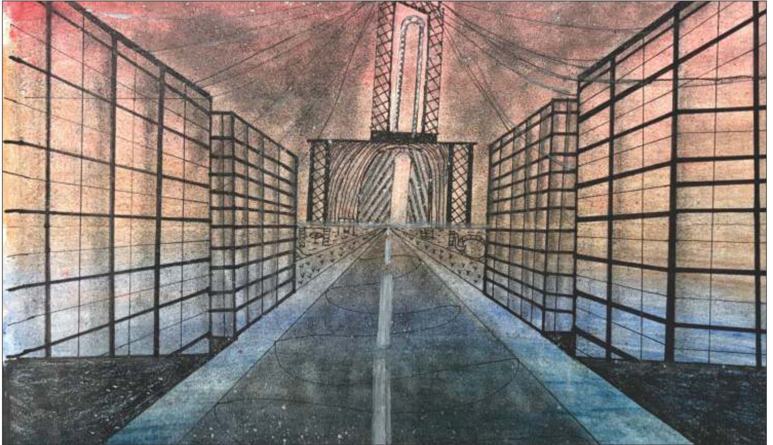
Apurvaa Vishwakarma, Student of class 11